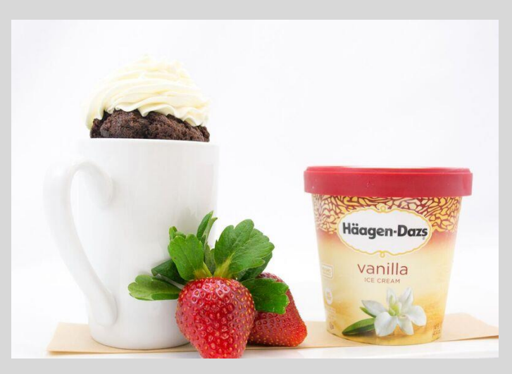
CHOCOLATE CAKE AND ICE CREAM 15 Fresh baked chocolate cake in a coffee cup, garnished with butter cream and sprinkles (can be personalized with a message for a special occasion).