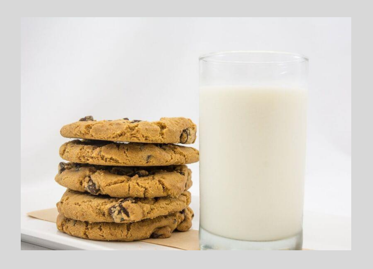
MILK AND COOKIES 20 Our house-made chocolate tollhouse cookies and ice cold milk satisfy the kid in all of us