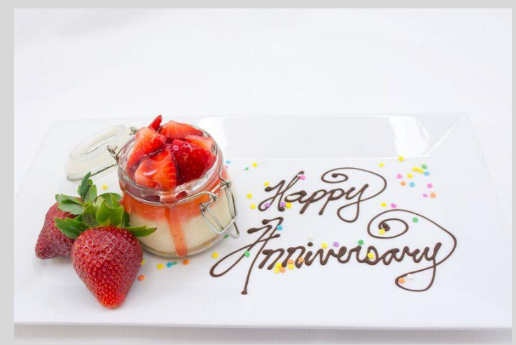
CHEESECAKE JAR 10 Mason jars filled with cheesecake and fresh fruit topping (can be personalized with a message for a special occasion).